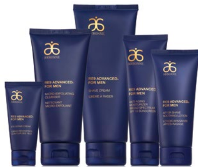
RE9 Advanced for Men