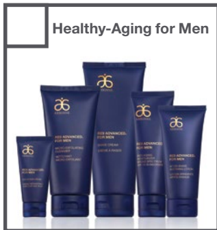
Healthy-Aging for Men

The RE9 Advanced for Men collection is the solution to address the unique needs of a man's skin, including healthy-aging and grooming.